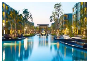
Lumpini Park Beach