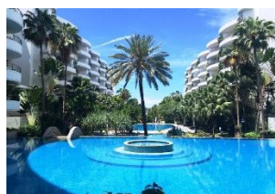
Baan Chai Talay