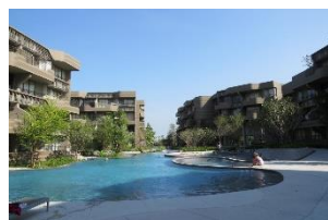
Baan San Ngam