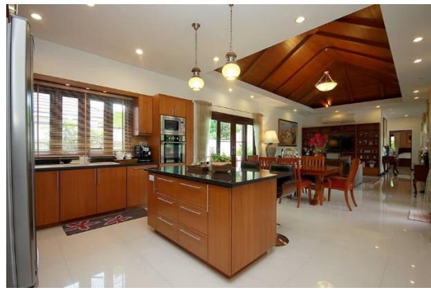
Spacious living-dining lounge