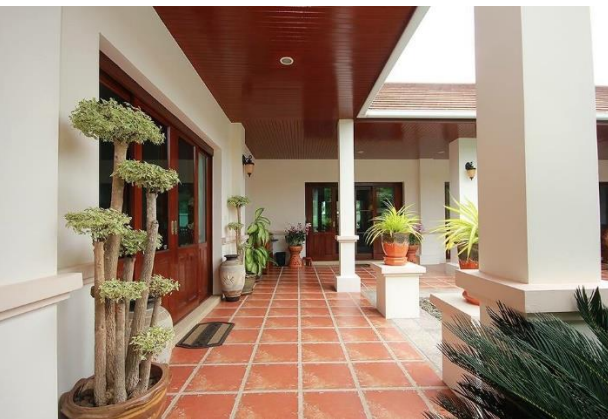
Fully covered patio along facades