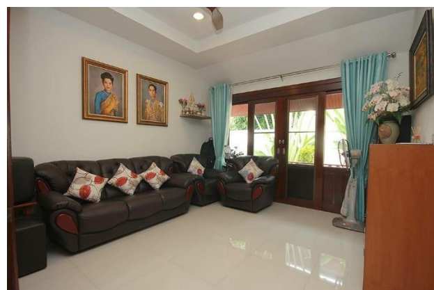
Bedroom #2 furnished for TV viewing