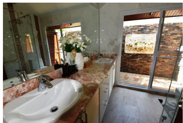
Ensuite master bathroom with outside shower