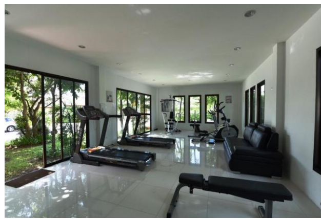
Communal fitness room within 30 meters