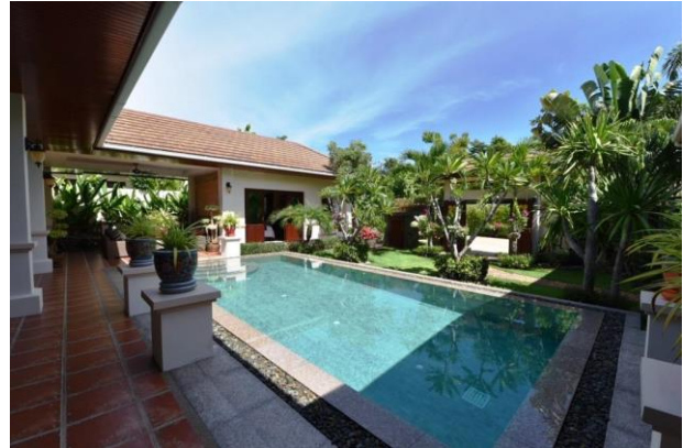
4x8 meter swimming pool