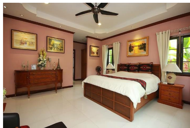
Spacious master bedroom