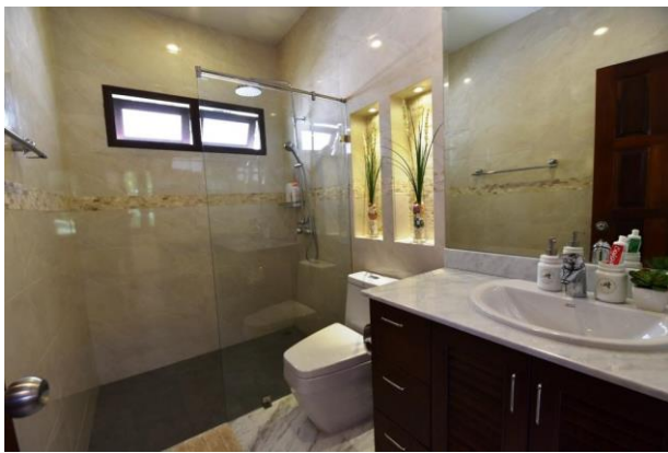
Ensuite bathroom #4