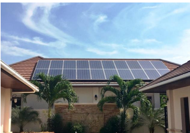
6KW Solar panel and Generator installed