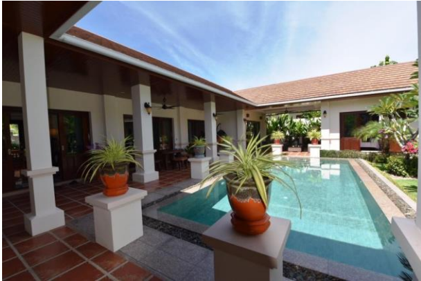
Hua Hin Hillside Hamlet Pool Villa