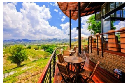
Hua Hin Hills Vineyard