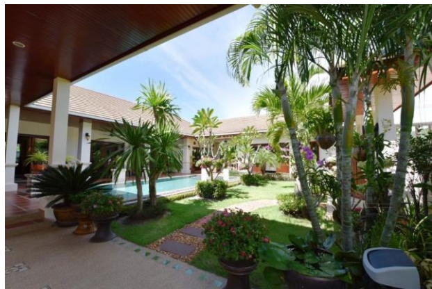
Beautiful landscaped gardens