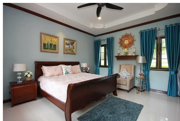
Large Bedroom #3