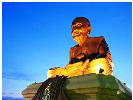
Black Buddha (Wat Huay Mk)