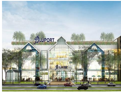
Bluport Department Store