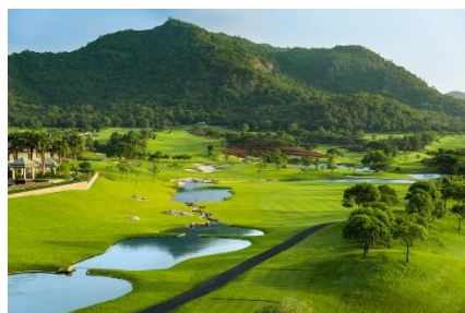
Black Mountain Golf Club