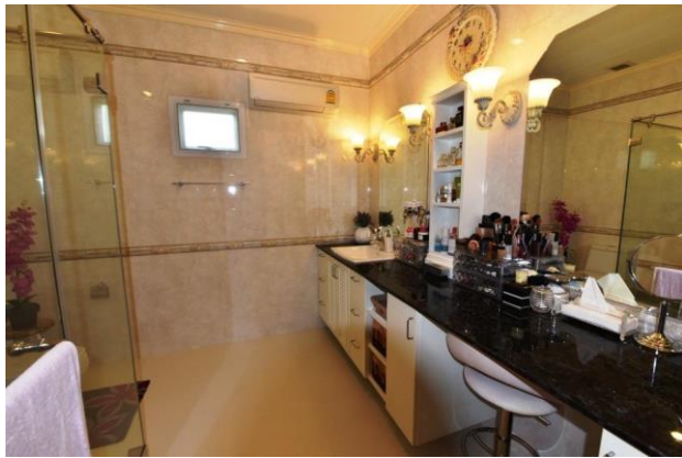
Ensuite bathroom #3