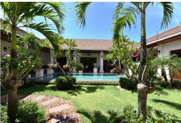
Beautiful landscaped gardens