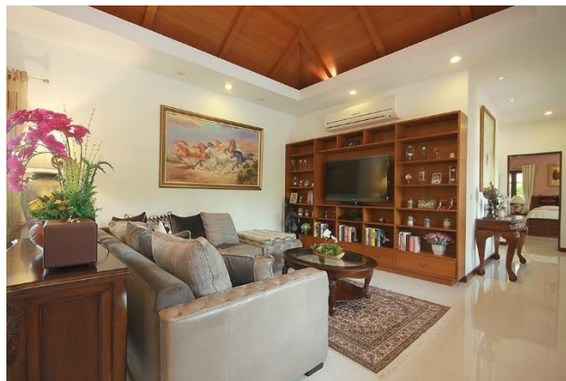
Spacious living-dining lounge