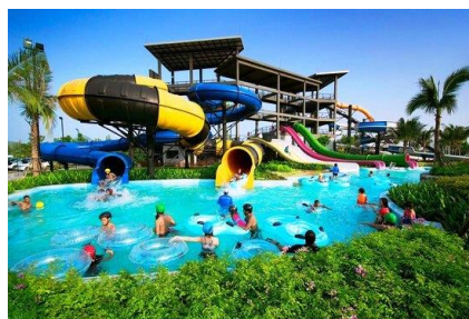
Black Mountain Water Park