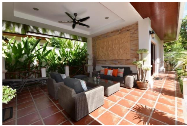
Tastefully furnished patio