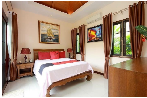
Guest bedroom #4