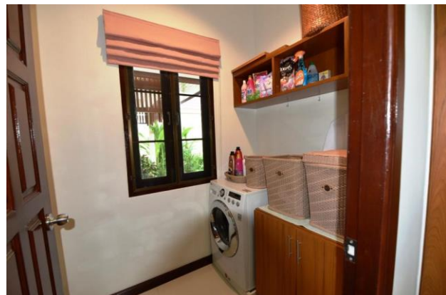
Utility room with washing machine